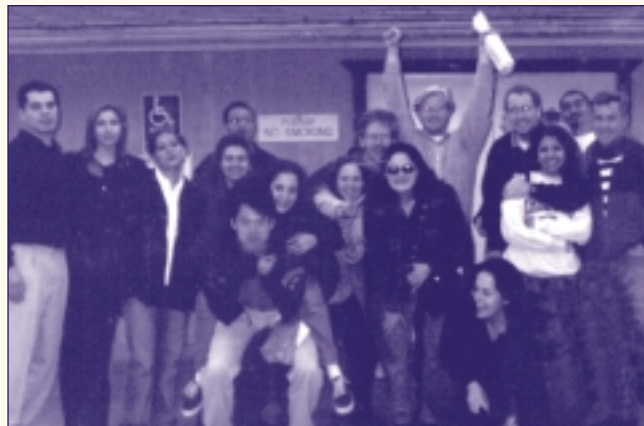
M.A. students in Latin American Studies program.

The conference attracted students from all over the United States and Latin America, including Mexico, Brazil, Peru, and Puerto Rico, who presented papers on topics ranging from indigenous art to media coverage of the war in El Salvador.